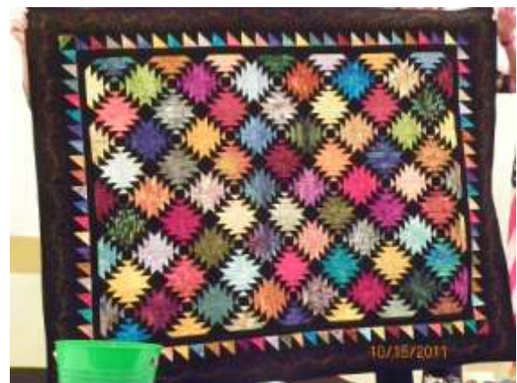
Member Show and Tell

VOLUNTEER??? WE ARE ALWAYS LOOKING FOR ANYONE WILLING TO HELP OUT AT RETREAT OR ANNUAL MEETING. IF YOU ARE WILLING TO DONATE SOME OF YOUR TIME, WE WOULD MOST CERTAINLY APPRECIATE IT. NOTE YOUR WILLINGNESS ON YOUR REGISTRATION FORM, OR CONTACT ANY BOARD MEMBER ONCE YOU GET TO ANNUAL MEETING OR RETREAT.