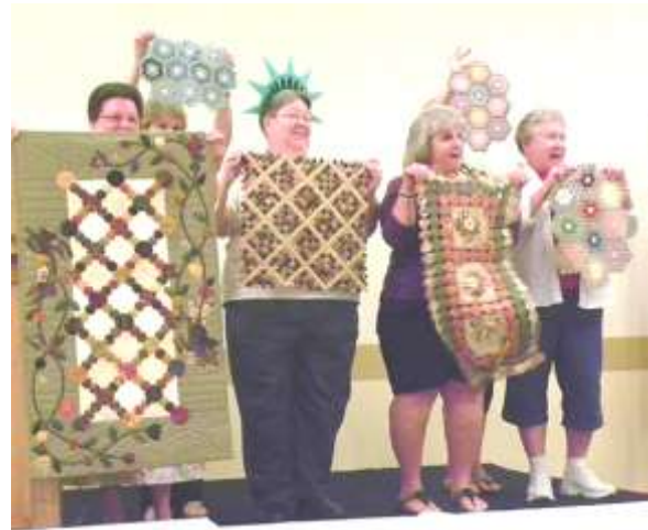
Class Show and Tell