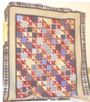
Jeanne Poore Trunk Show