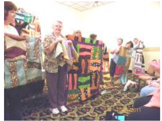
Class Show & Tell