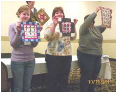
Class Show & Tell