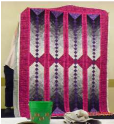
Member Show and Tell